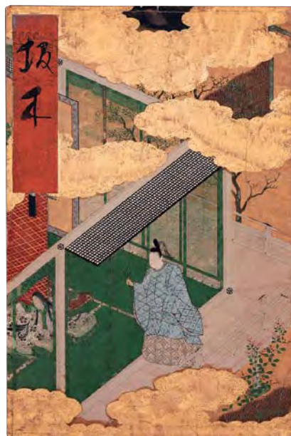
From : The Green Branch (Sakaki), Chapter of 10 of The Tale of Genji (Genji Monogatari). Kyoto, ca. early 17th century. The New York Public Library, Spencer Collection Courtesy of The New York Public Library

Ehon, a Japanese word meaning "picture book" is usually filled with calligraphy, essays and poems. This exhibit will show Ehon, from its origin to contemporary design in a display of the genre's book art, major influences and popular themes. With the many changes this art form has endured, this Japanese literary tradition, dating back to the