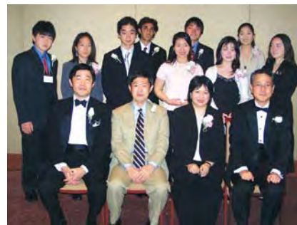
JAA awarded 11 H.S. graduates scholarships in May '06.

JAA provides social welfare services to the Japanese and Japanese American community through its network of dedicated volunteers. In 1994, with the con-