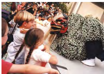
Children enjoy traditional shishimai (lion's dance) at Japan Society

Info: 212-715-1258 or www.japansociety.org