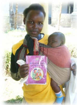
Kenyan mother and baby with MCH Handbook